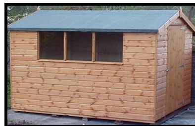
Standard Garden Shed

All Prices are + V.A.T. @ 20% www.cheshamfencing.co.uk